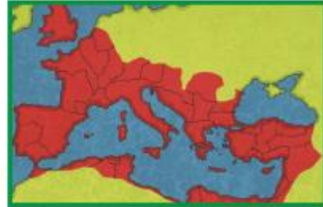
The Roman Empire in AD 117

The Romans were a group of people who were named after this important city. However, many soldiers fighting in the Roman army did not come from Rome itself. Instead, they originally came from one of the many countries which formed part of the Roman Empire.