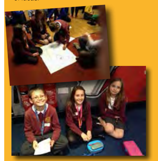
By Hayden (Kestrel class) Student Voice

Then we stopped to have lunch, the room was extremely crowded, we had lunch for about 30 minutes. Finally we came up with ideas of how to make our school bully proof. We came up with a lot